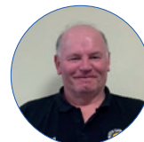
George Williamson Transport