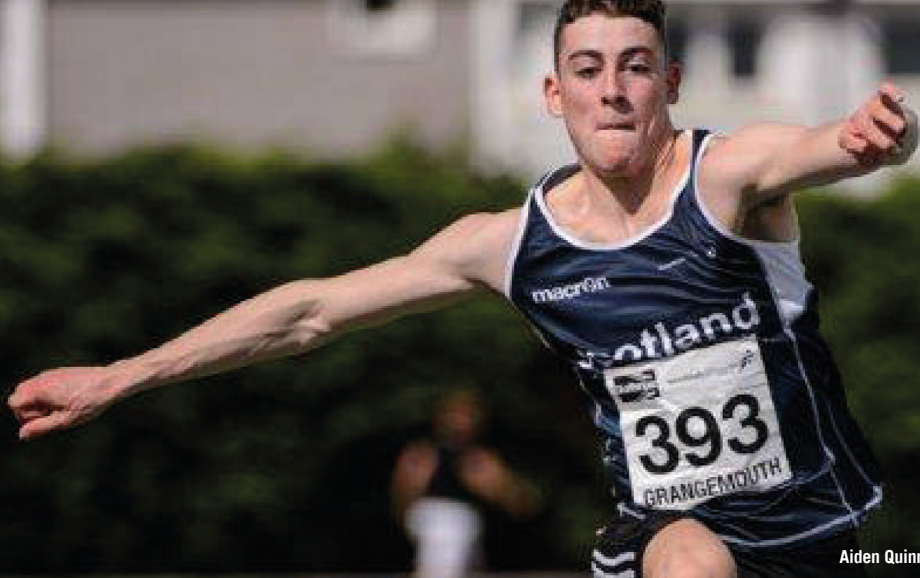
Aiden Quinn in action