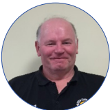
George Williamson Transport