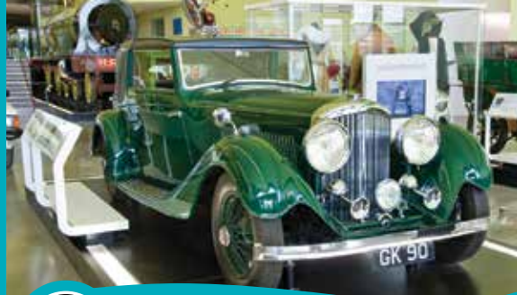
1 Windscreen Wimps