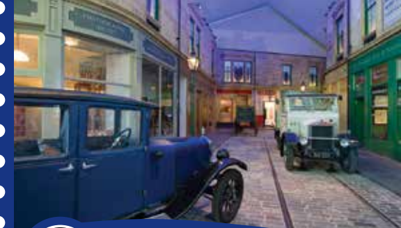
5 Main Street (Choose ONE Shop)